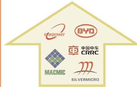
Chinese players are also expanding their capabilities, production capacities and technological knowledge.

The huge business opportunity in the power device market is attracting interest from various players in the power electronics and automotive supply chains. With a strong focus on power modules, changes in business models and a constant re-shaping of the supply chain are expected, especially in the very dynamic power module packaging market.