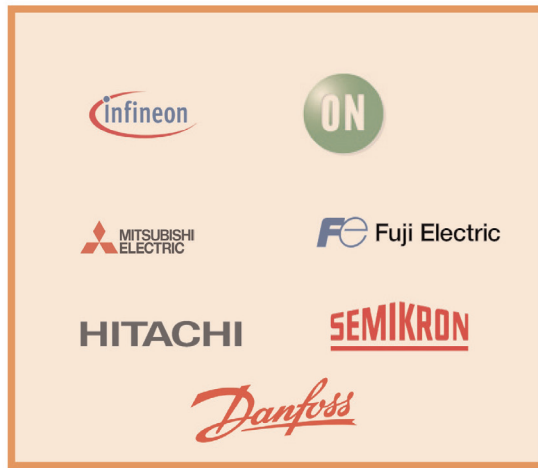
Global power module packaging giants.